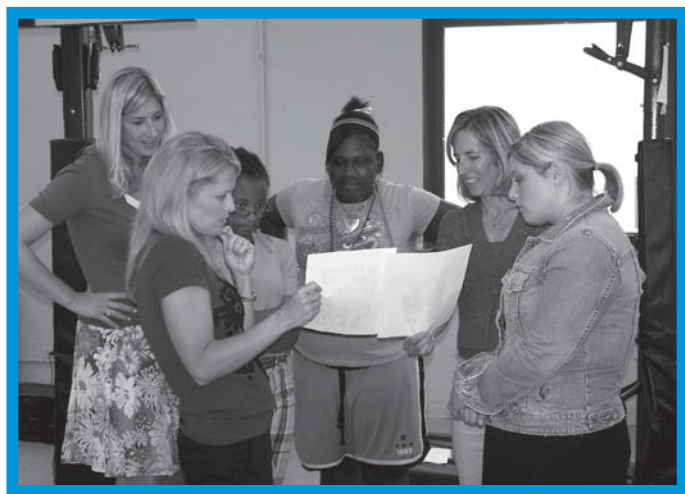
OPTIONS Class 9 members at a Girls Inc. of Greater Indianapolis site visit.

Each year 20 exceptional women are selected to be part of a strong and vibrant OPTIONS class. This year was no different. From community leaders to an engineer, a dentist to a realtor, these women represent a class of leaders actively engaged in the community and interested in improving the lives of women and girls.