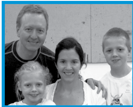
The Aquilano Family

If you are interested in learning more about GO: Give Back, and to view Family Philanthropy Day videos, visit www.womensfund.org/go-give-back .