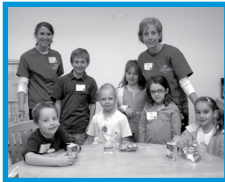
An elementary group takes a break

After hearing the Salwen's story, families were divided into age-specific groups to explore concepts shared in the Salwen's book, The Power of Half , such as: "What's your half?" (What can you give?), "Follow your heart," and "Use your voice." Parents