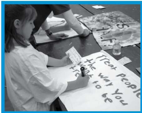
An elementary-age participant works on a pillowcase

Women's Fund thanks The Glick Fund of CICF for making Family Philanthropy Day possible, as well as the volunteers and Indianapolis Art Center staff who led dynamic programs.