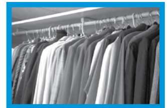
Training, Inc. provides professional clothing options for clients.