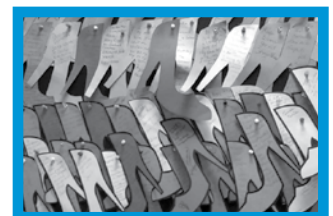
Women in the Professional Women's Group at Dress for Success share "steps to success."