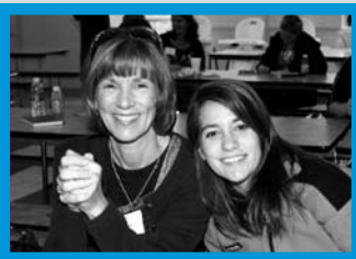
Participants at 2009 Power of Girls

The cost of this program is $250 per adult/girl couple. All of the money contributed will help fund programs of The Julian Center and Women's Fund of Central Indiana. Participating girls will determine how to allocate The Julian Center contribution based on the day's experience and a grantmaking process led by an experienced facilitator. The content will be age appropriate for girls 13–16 years old. Sorry, we cannot make exceptions to the younger age limit. At the end of the day, a keepsake will be presented. The lasting gift – the inspiration of daughters, granddaughters, nieces and young friends – will be taken home in the hearts of the girls.